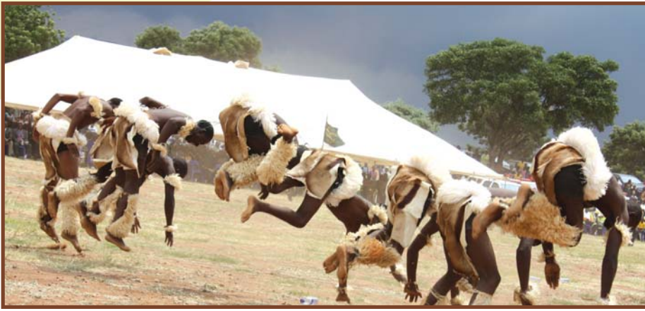
Tidonki Xigubu xa Ka Bungeni displaying their fine art at the Human Rights Day celebration