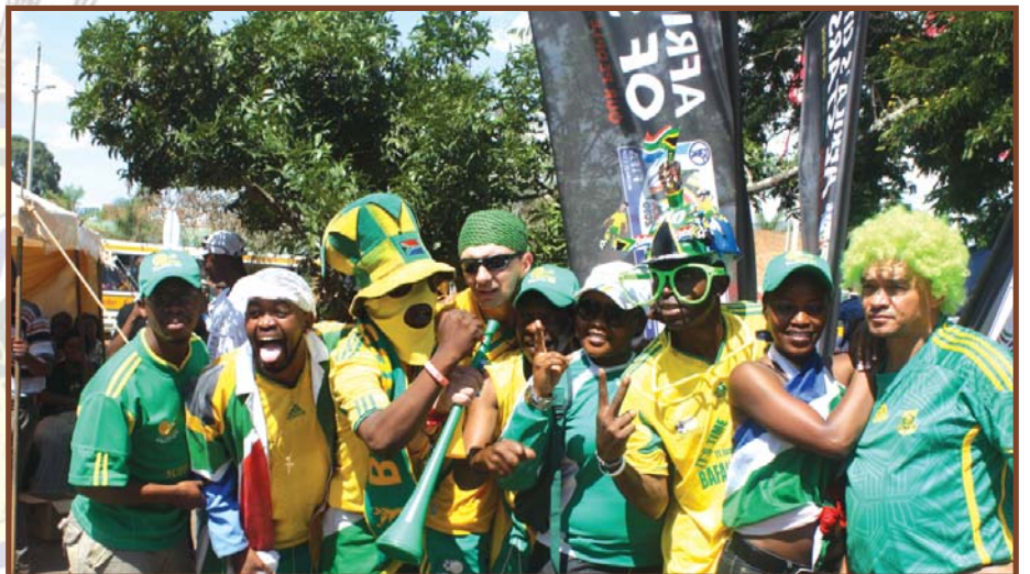
Football lovers in a frenzy at the launch of Football Friday

The Local Organising Committee and soccer ambassadors moved in and around the town of Louis Trichardt in a truck with blaring sound distributing information leaflets and other merchandise.