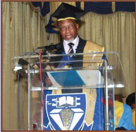
Deputy President of the Republic of South Africa Honourable Mr. Kgalema Motlanthe at his Inauguration as the new Chancellor of the University of Venda

Africa, Kgalema Motlanthe as its new Chancellor on the 09 March this year. The ceremony was held in the University Auditorium.