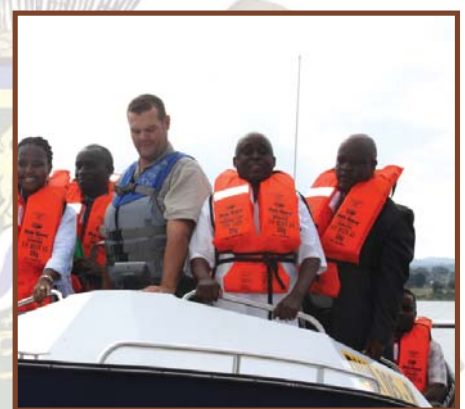
The new dam monitoring boat in action at the Nandoni dam

In conclusion the Deputy Minister said “I feel very strongly that our department, local government, education, health, human settlement, agriculture, community and traditional leaders and all water services stakeholders will continue to engage one another in dealing with issues of water service improvement because : TOGETHER WE CAN DO IT ”