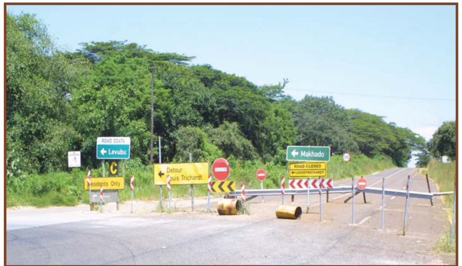
Motorists traveling from Thohoyandou to Louis Trichardt had to use the detour road along the Luvuvhu farms as a result of the collapsed bridge. The road through the Luvuvhu farms that is being used as a detour is also going to be fixed according to MEC Kekana.

According to the MEC the reconstruction of the Lutanandwa bridge will once again contribute to the economic activities in the Vhembe District by relinking the villages and towns and by reducing travel distances among business communities. The contract, the MEC continued, makes provision for the employment of local labour. R1,8 million has been budgeted for labour utilization in this regard. Furthermore, the local SMMEs stand to benefit from the R3,6 million that will come their way through subcontracting.