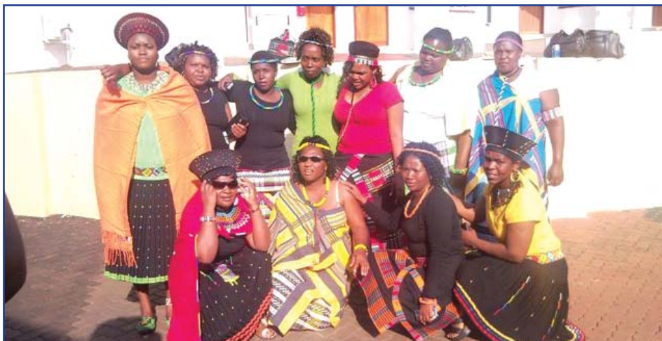
Some of the Women delegates who attended the Vhembe District Municipality women's celebration pose for a photo.

More than 500 Women of Vhembe District Municipality gathered for the annual Women's Day celebration at the Makhado show ground.