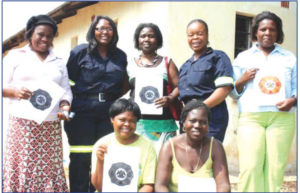
Some of the Participants at the Stop the fire and Save our natural habitat workshop taking time out for a group photo.

Currently the training is taking place at Ramukumba under Nesengani Traditional authority. Over 100 volunteers are being trained. The course on elementary training has five modules. Learners are taught the origin of fire, the means through which fire spreads, methods of which fires can be extinguished,