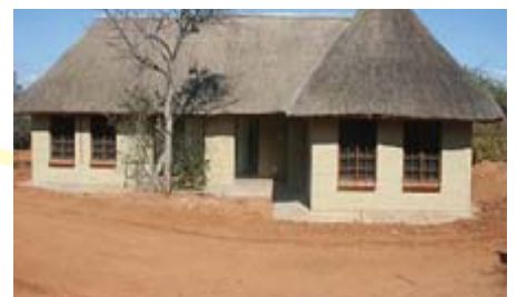
Part of Awelani Eco-Tourism Park at Tshikuyu Village in Mutale Local Municipality.