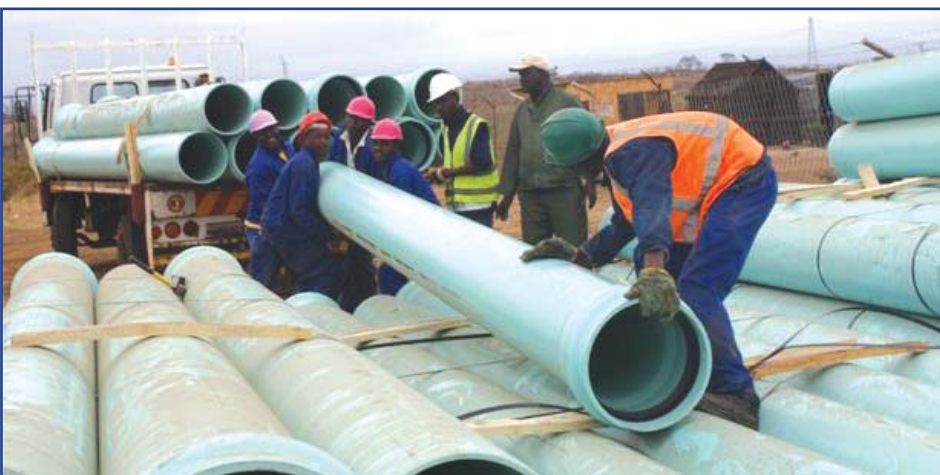
Workers busy off loading part of the consignment of water pipes for the 5,2 km Nandoni dam to Malamulele town pipe line

Community members of Malamulele Town are over the moon because of the bulk water supply project which will end one of the longest challenges of water shortage in the area.