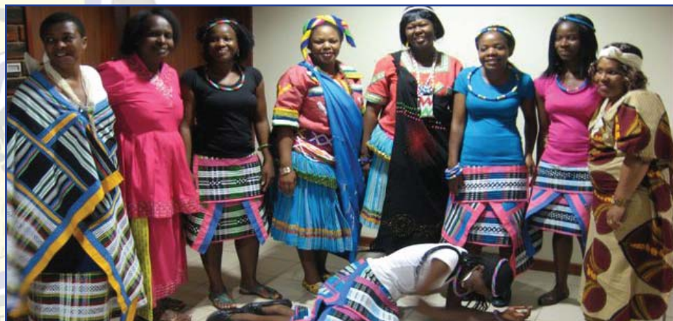
A Woman in Minwenda demonstrates "U Loshu" which in Venda Culture symbolises profound respect by Venda women

Councillors should start to prioritize programmes of women economic empowerment Cllr Dr Falaza Mdaka concluded.