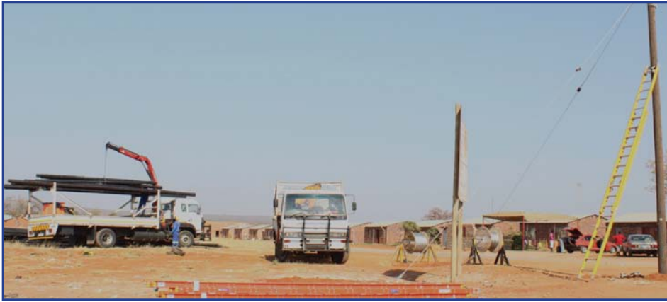
Visible service delivery taking place at the Musina Local Municipality