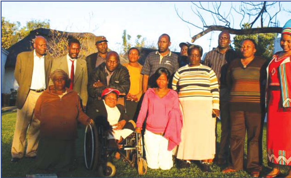
New leadership of the Vhembe District Disability Forum pose for a group photo

Vhembe District Municipality and Vhembe District Disability Forum organized a two days District Disability Forum Conference at the Lalapanzi Hotel. The conference was attended by more than 70 delegates from all four Local Disability Forums.