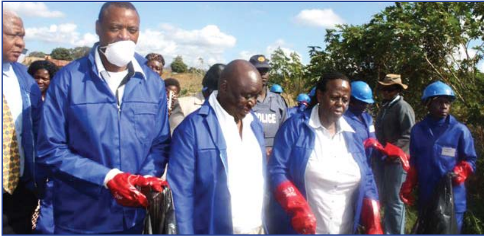
Deputy Minister of Water and Environmental Affairs Vho Rejoice Mabudafhasi on the right and the Executive Mayor of Vhembe District Municipality Dr Falaza Mdaka on the left both with red gloves at the newly launched Adopt a River Campaign

Vhembe District Municipality was a hive of activities when the Deputy Minister of Water and Environmental Affairs Vho Rejoice Mabudafhasi, launched Adopt a River Project in Limpopo at the Tshisaulu Sports Ground.