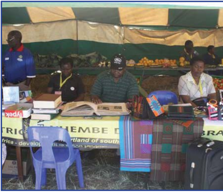
Exhibition of a variety of products at the rural development celebration at Ha-Mangilasi

funds were used to build a pack house which is still incomplete. The pack house will be used to process products to be taken to markets.