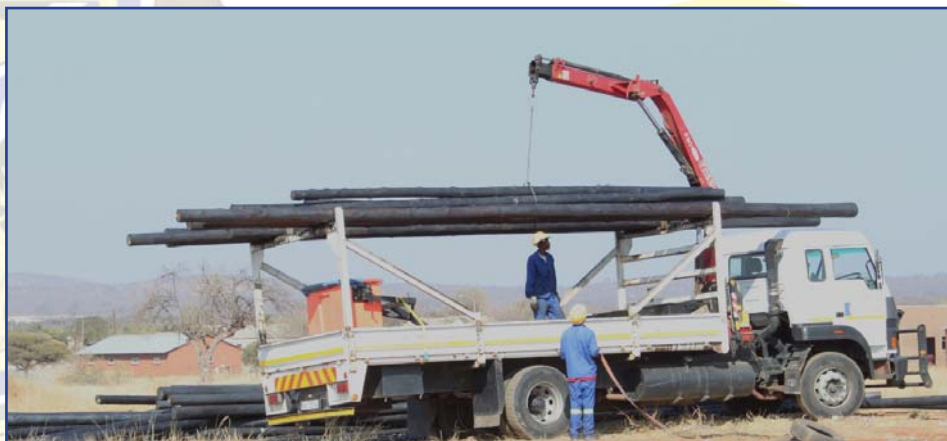
291 house holds at Musina Extension 9 and 10 stand to benefit from the Musina Local Municipality electrification project

In what has already been described as a landmark achievement in the history of Musina, 291 households at Musina Extension 9 and 10 will benefit from a R2,1m electrification project which is in progress. The project, with financial support from the Musina Municipality and Vhembe District Municipality, is expected to be fully completed on 15 November 2010. The district municipality public participation programme brought a major relief to the community of Musina because