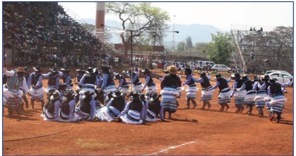
One of the many cultural dances that entertained the crowd at the Heritage Month Celebration

Instead of only sitting at home switching your TV and radio sets on and off, why can't you go out and enjoy the wonders of nature around you and reduce stress? asked the organizers.