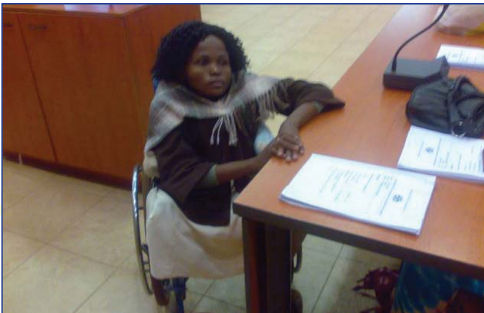
A delegate at the Supply Chain workshop for persons with disabilities held at Thulamela Municipality Council Chambers. The workshop was organised by Vhembe District Municipality to respond to one of the resolutions taken at the Vhembe District Disability Forum conference held this year