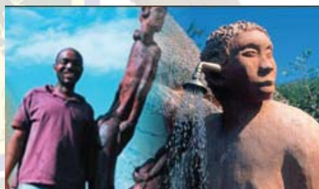
Some of the fine art work found in the Vhembe District Municipality

SERVICE DELIVERY MONITORING AND EVALUATION